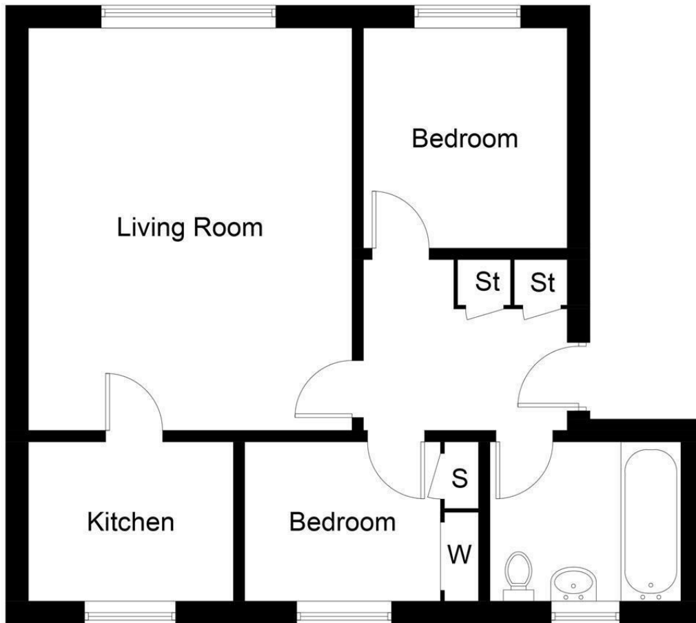
Illustration for identification purposes only, measurements are approximate, not to scale. floorplansUsketch.com © (ID975086)